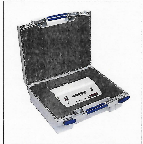
Instrument supplied in carrying case.

The model L40 Liquid Conductivity Meter out-performs many instruments by measuring electrical conductivity to below 1 \text{ pS.m}^{-1} ; this is an essential requirement for determination of ignition hazard. The instrument is easy to use with a direct readout of conductivity on a back-lit digital display and is auto-ranging covering 0.1 \text{ pS.m}^{-1} - 1.0 \times 10^8 \text{ pS.m}^{-1} . High precision is achieved by an inbuilt microprocessor-controlled auto-zeroing function before every measurement. The metering cell takes only 36 ml of liquid and is connected to the body of the instrument by short signal cables. This avoids damage to the instrument fascia panel in the event of liquid spillage. The stainless steel cell can be detached from its PTFE base for sample collection and ease of cleaning. Additional cells are available enabling multiple sample collection.