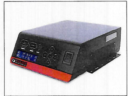
The display and keypad can be rotated by 180° for wall mounting. Please specify 'inverted display' on purchase orders.