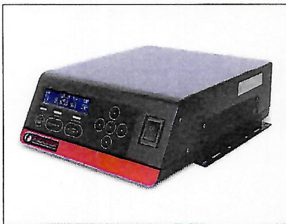
Standard 'bench top' fixing bracket position.

The IONFIX range has been designed for ease of use with brackets for flexible mounting.