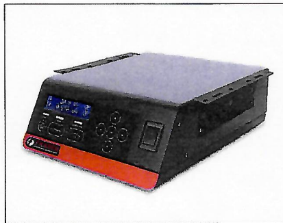
The brackets can be fitted to allow for 'under bench' mounting.